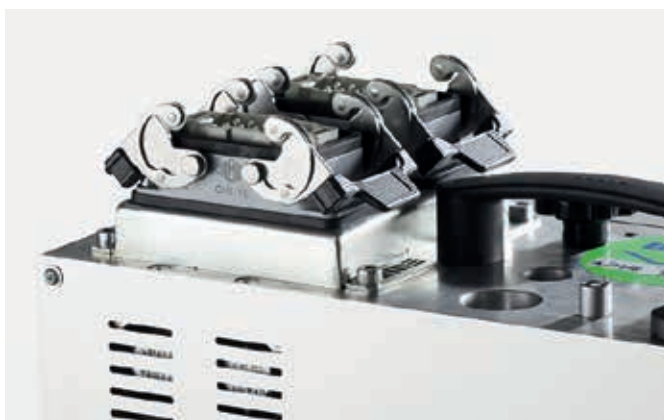
Industrial quick connectors for fast replacement.