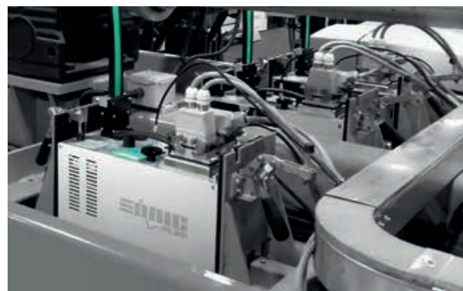
Installation on a vertical strapping machine with press (cardboard application)