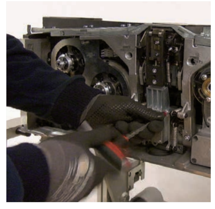
Detail of fast replacement of Welding Group.

The head is available in two different models: Standard and TR1400HD version (with blade cleaning system and knurled pliers).