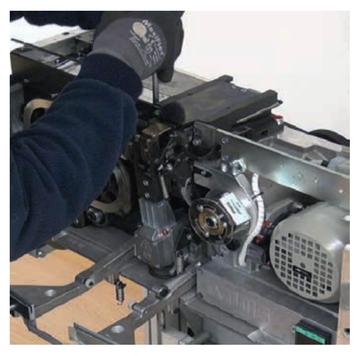
Detail of fast replacement of Clamping Group.