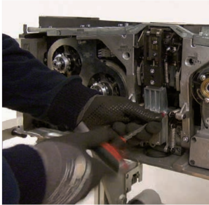
Detail of fast replacement of Welding Group.